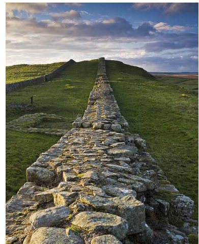
Caw Gap, Hadrian's Wall