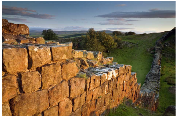
Walltown, Hadrian's Wall

Over dinner and into the evening on Saturday, we will have an opportunity to discuss any number of photography topics! In the warmth and comfort of our private sitting room, digital users will be able to see the results of their day's work, via a digital projector, and these images will facilitate discussion on various aspects of the photographic process.